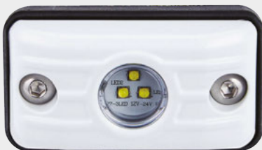
7815WM White Housing