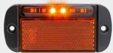
SIDE MARKER ACTIVE