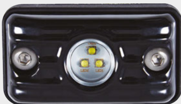
7815BM Black Housing