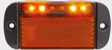
SIDE INDICATOR ACTIVE