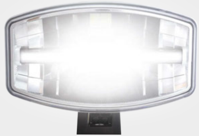
R112 DRIVING LAMP