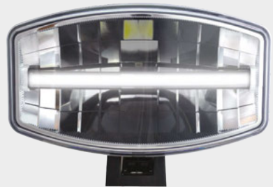
R7 FRONT POSITION LAMP